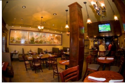
John Paul's Restaurant & Gathering Place

At the 1929 Hotel Seville, Motorcyclists are greeted with First class lodging, covered motorcycle parking and the ONLY lodging facility in the area to offer an in-house restaurant and bar. A great historic property, travelers will enjoy a great nights sleep before venturing out for the next days ride. We make it easy with our Two wheels - Two Meals overnight package.