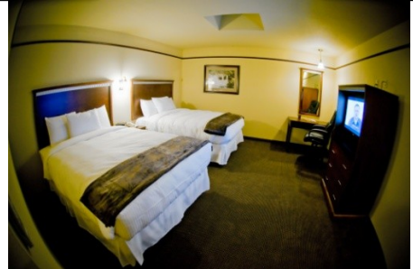
Guest rooms - 100% restored

Reserved Motorcycle Space Two dinners in John Paul's Motorcycle Rags Continental Breakfast Two 30 minute Massages